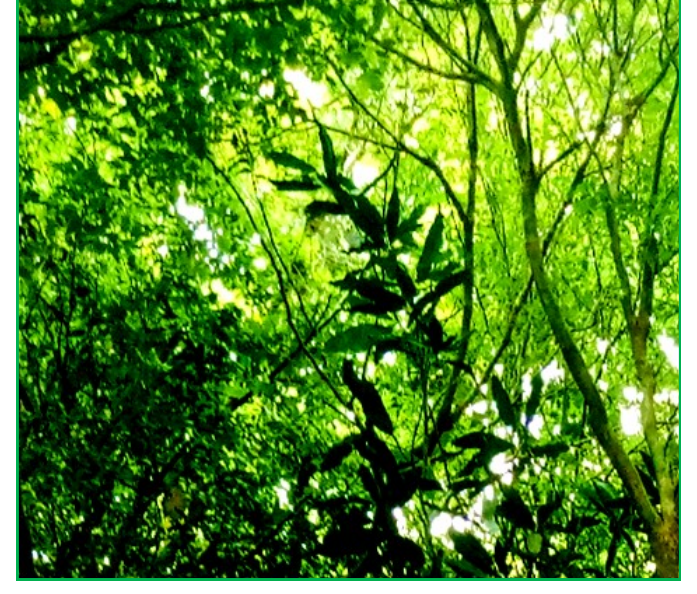
Geography is mother of science.

Closing Date for Application: 31<sup>st</sup> May 2022