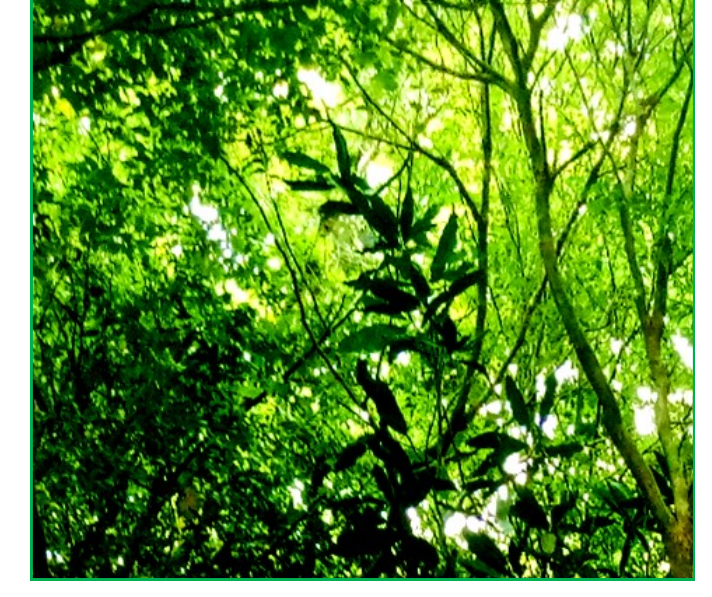
Geography is mother of science.

04 months (Saturdays only 8.30am -4.00 pm)